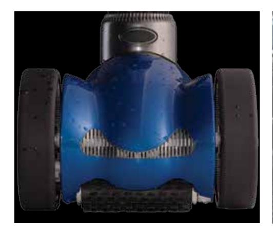
The built-in rotating brush makes quick work of hard-to-remove debris and is great for sandy environments and new pool finishes