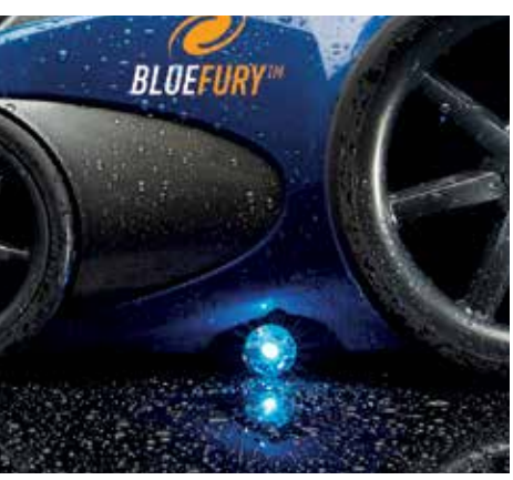
NIGHT CRUIZE™ LED