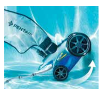
Steady-Grip Traction Front-wheel drive provides superior floor-to-tile cleaning