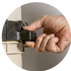
Easy to open locking ring. Click and twist. (only for Clean & Clear, Clean & Clear RP and Posi-Clear RP)