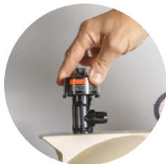
Easy to use high flow air relief valve