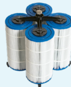
For larger pools

There is the choice between a < single-element filter or a multi-element filter. >